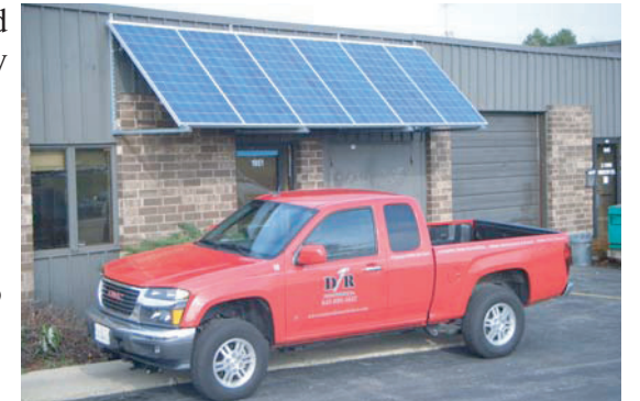
We installed this small solar panel outside our shop. With the A/C off, it runs more than half our office load!

Feel free to browse the catalog at www.aesolar.com to see which one fits best for you.